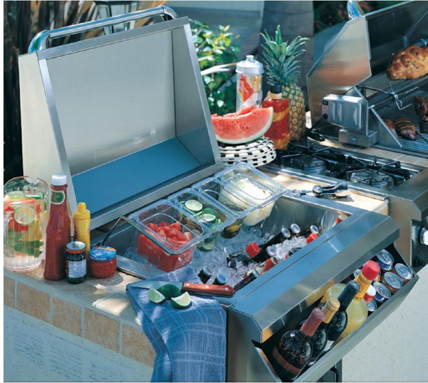
26CLRBI (shown w/ PRO26CLR-FRT)